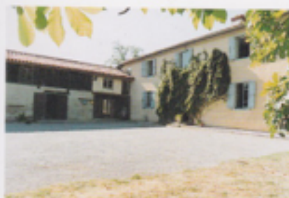
TRIE SUR BAISE 9 kms

Family sized farmhouse with private drive & courtyard. Hall, living, dining, kitchen, utility & workshop. 5 bedrooms, 2 bathrooms. Outbuildings and barn. Garden & plantation. 10,000 sqm approx.