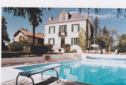
STE DODE VILLAGE

For these or other properties for sale in Gascony contact Ian Purslow