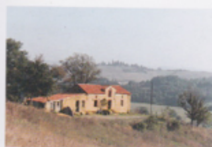
MARCIAC 5 kms

Partially restored cottage in delightful rural setting. Reception, kitchen, bedroom & bathroom downstairs. Open plan area for division above. Immediately habitable. 10,000 sqm pasture. Oak wood.