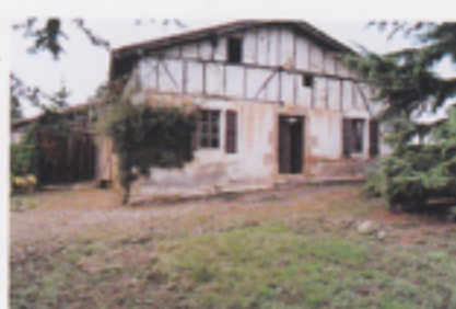
BASSQUES 1 km