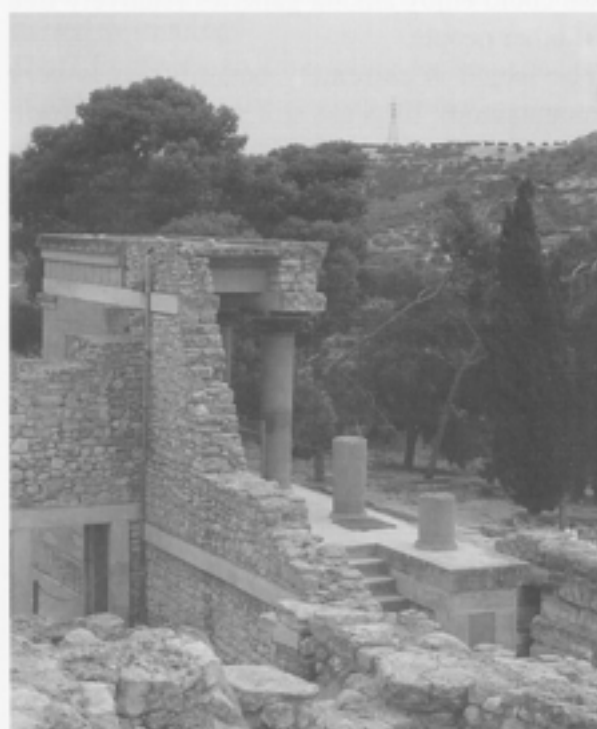
Part of the ruins at Knossos

important, Elounda being an hour's drive east of Iraklion. Clearly Knossos.