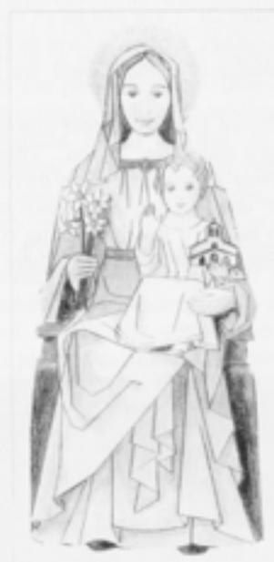
De La Mare de Déu de l'Oratori

I put a bunch of white daffodils – called "grandalles" in Andorra – to show the typical flowers of Andorra and in that particular place there are a great many of them in springtime. Little Jesus bears a reproduction of the old Sanctuary in His right hand, showing that this is the way that leads there, and with His right hand he greets the people passing by, wishing them a good journey.